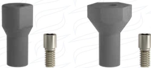
Intraoral scanbody for straight conical abutments

To be inserted on an analogue in a model.