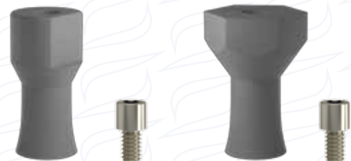
Intraoral scanbody for tilted conical abutments

To be inserted on an analogue in a model.